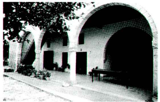
Figure 9 Well-integrated spaces in a traditional Cypriot residence

2000/2001). Stone and mud brick construction employed natural materials readily available from the locality. Houses could be built and taken down without polluting the environment. The small size of their construction units made them easy to handle and one could easily put them in place and also adjust and modify the space and details so that they felt comfortable. Also, the thickness of the wall, usually 40 to 50 cm, kept the building space warm during winter and cool during summer. Building openings were also small so as not to allow too much energy to escape or enter. Furthermore, thick walls allowed people to personalise their space by creating window seats, bookshelves, etc.