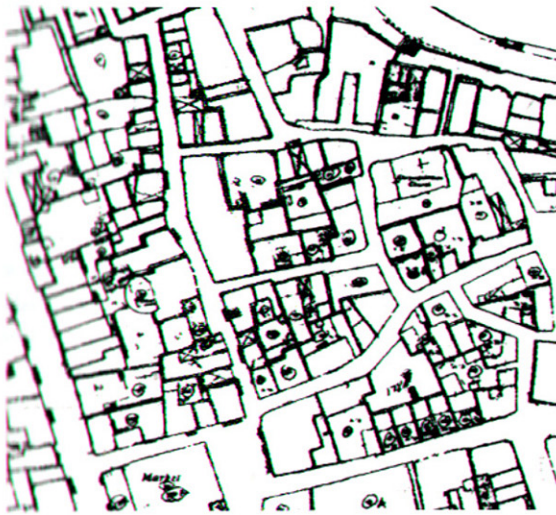
Figure 1 Typical traditional urban layout in a Cypriot town

These positive social-spatial qualities pertaining to the older settlements are never reflected in new housing developments. These modern developments lack any local social and traditional values, both in individual houses and multistorey apartments. The most negative design aspects that cause social segregation in these settlements are the incoherent formation of buildings, creating a 'no man's land' around buildings, and the lack of a positive transition and interaction between indoor