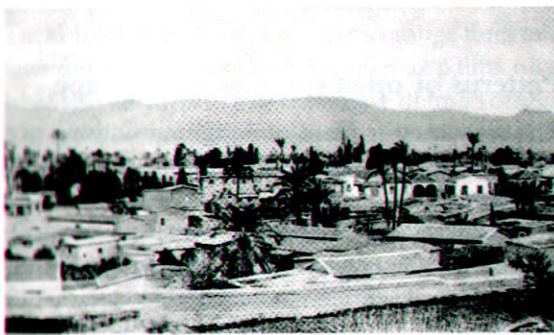
Figure 2 Traditional urban context in Nicosia