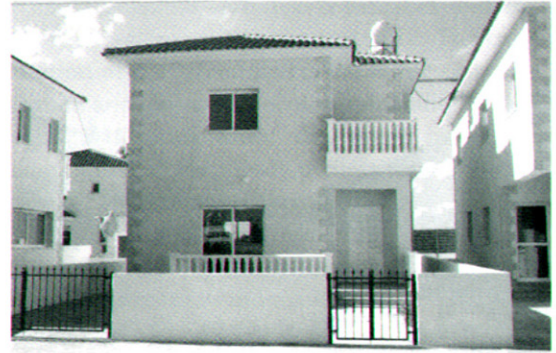
Figure 8 Front façade of a contemporary house

Traditional building construction systems and materials were not only sustainable but also energy efficient and user friendly, allowing the users to participate in the building process (Pontikis