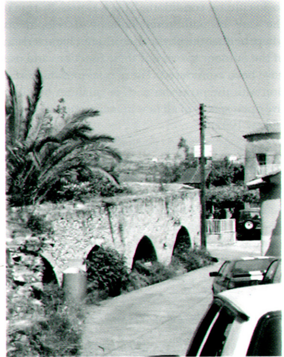
Figure 6 Date palms and aqueducts as dividing elements in Lefka

As revealed by Oktay's (1997) study in Northern Cyprus, open spaces are a cornerstone in the daily life of people, and satisfaction with their dwellings greatly depends on the quality of their private and