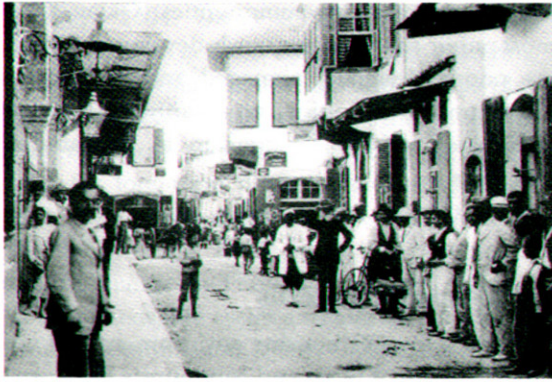
Figure 3 Active use of the street in the mixed-use centre of Nicosia in former times