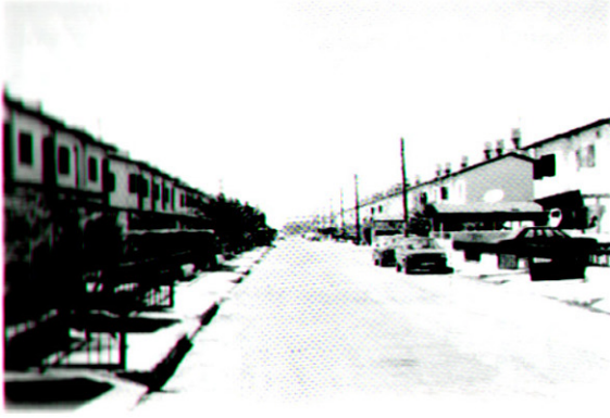
Figure 5 The street in a new housing environment in Famagusta

cityscape, which is generally informal in character due to the effect of Ottoman urbanism, and despite the lack of planned squares and an active use of squares ( meydan in Turkish) by people, there was a social and psychological tendency towards meeting and gathering in open spaces (Eldem 1987; Cerasi 1999). Many small public squares once existed within the Ottoman quarters, at intersections of streets or in front of significant buildings, clearly showing their importance in the social life of the cities.