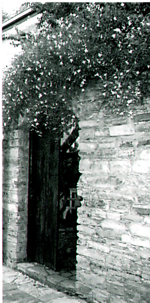
Figure 12 Typical Cypriot house entrance adorned with jasmine