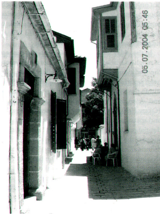
Figure 4 Active use of the street in a Nicosia neighbourhood today

and outdoor spaces within a hierarchy of semi-public, semi-private and private spaces.