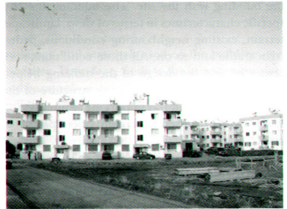
Figure 7 A new housing complex, lacking greenery

semi-private open spaces. However, in new developments, these spaces lack the qualities that provide positive meaning and availability to residents. They are often built on flat sites with no trees, and stand as isolated concrete towers, missing the opportunity to create some unity through the use of landscaping. It is also unfortunate that there are no conscious efforts to green surrounding spaces (Figure 7). Residential exterior spaces lack responsiveness to the users' needs, their lifestyle and their