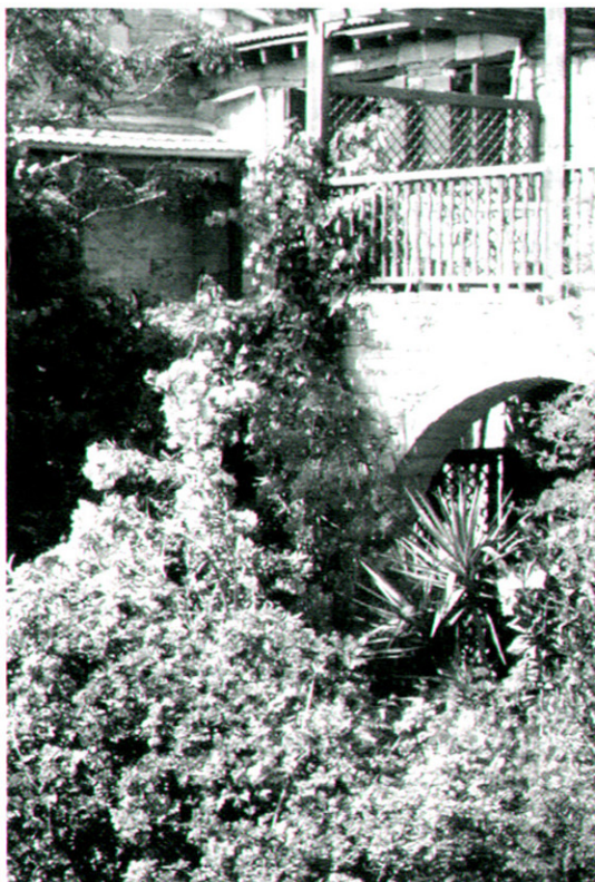
Figure 11 A private garden with local vegetation

modern urban and architectural development practice in Cyprus cannot be considered sustainable. There is little knowledge and experience of implementing sustainable housing (Oktay 2004) and, due to serious institutional problems related to housing, there is a need to focus on some sustainability priorities. Traditional settlements on Cyprus, like vernacular patterns worldwide (Alexander 2004), are excellent examples to learn from as they represent a long-established culture, good uses of local values and resources, matched to local skills, to meet people's needs. Acknowledging the fact that housing not only satisfies the basic need for shelter, but also satisfies other needs